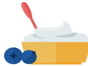
Yoghurt (full fat for under 2 years, reduced fat for over 2 years)