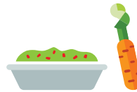
Vegetable sticks and dip